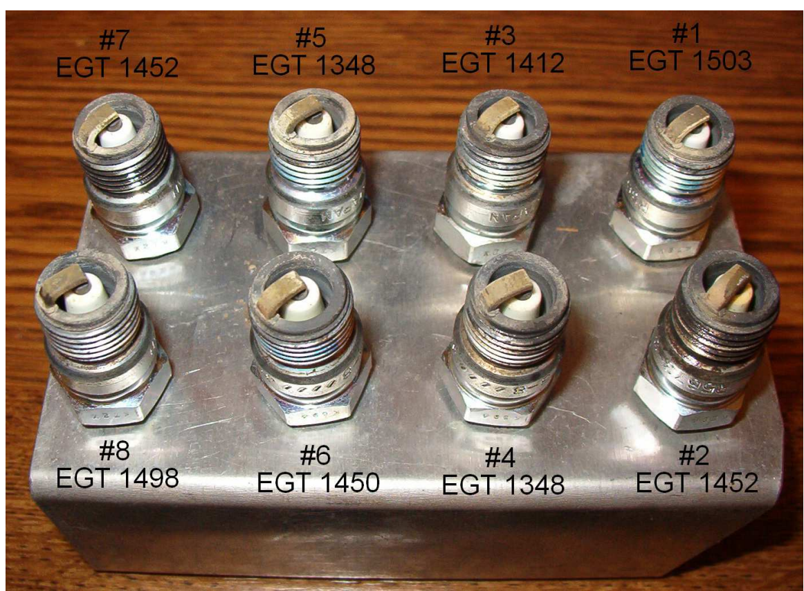
The plugs above show the irrelevance of correlating EGT to plug colouration.

outer shell has consistent deposits throughout, water temperature is not an issue, the strap is nicely coloured with very even fine deposits. It's possibly a smidge lean, it might have been the air density of the day etc. It's nice to work with an engine like this. The lower CFM carburetors have altered the atomization of the fuel and the result is better temperature control even when slightly lean for the load and a more readable deposit within a short time giving readable results. The combustion temperature is probably high as indicated by the appearance of slight yellowing on the lower band and yet the strap is not stressed. I cannot provide information of the total fuel flow as there is no data logging of that on this car but it used significantly less fuel to achieve the same lambda as the first photo from this engine shown above.