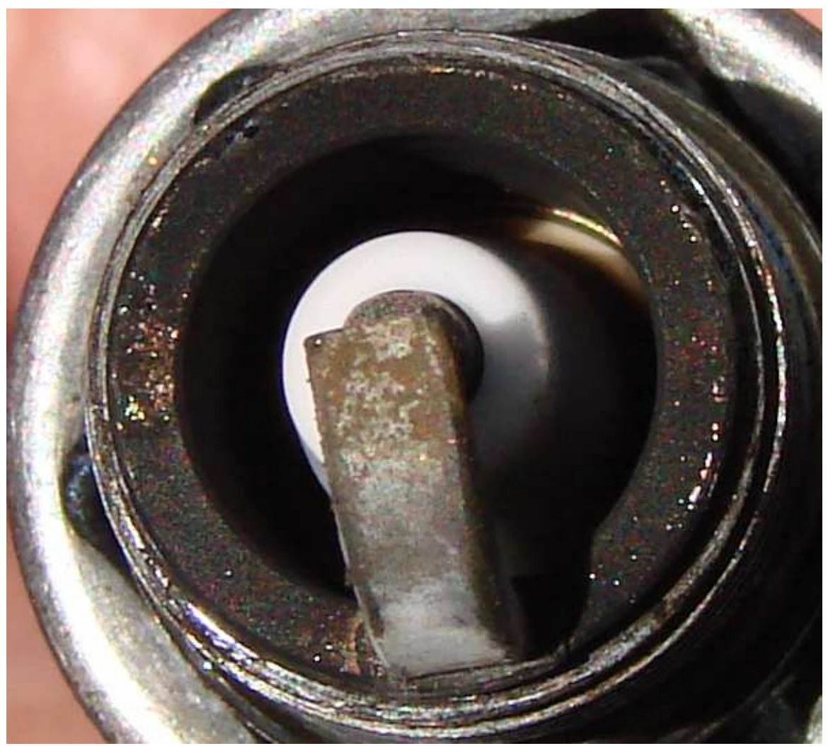
This plug is from a 308 Holden running unleaded street fuel. The engine made 153hp at the wheels. It had every ring broken on every piston; it had leaking valves and a smoke trail 3 feet long pouring out the breather but no smoke out the exhaust. You can see the tan colouration forming at the base of the porcelain and some tan specks starting near the 4 o-clock position near the roll on the top of the porcelain (its in the shadow a bit). But you can see tan easily on the strap electrode. The outer ring deposits are not soot and there is no evidence of oil combustion. The outer ring colors appear to be rainbow like but that's a digital camera anomaly, it wasn't like that to the eye. This picture shows what good vaporization can achieve on a stuffed engine. When using large droplets this engine produced oiled and soot covered plugs and blue exhaust smoke. So I retuned it for smaller droplets and it responded well.