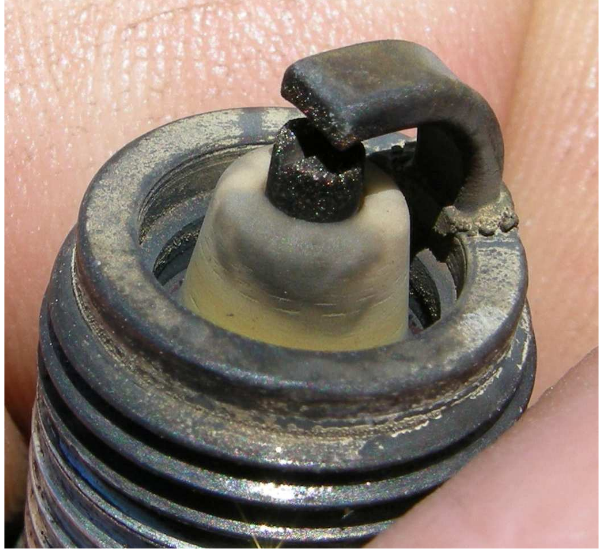
It is easy to see the damage to the center electrode and that the arc is blowing out to the outer shell of the plug. The intake valve is toward the back side of the photo. You need a powerful ignition to achieve this level of arc discharge and not get a misfire. This is a MSD 10 plus ignition. The engine did not misfire when arc blow out occurred but it changed exhaust sound and lost some power.